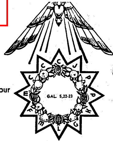
FRUITS OF THE HOLY SPIRIT